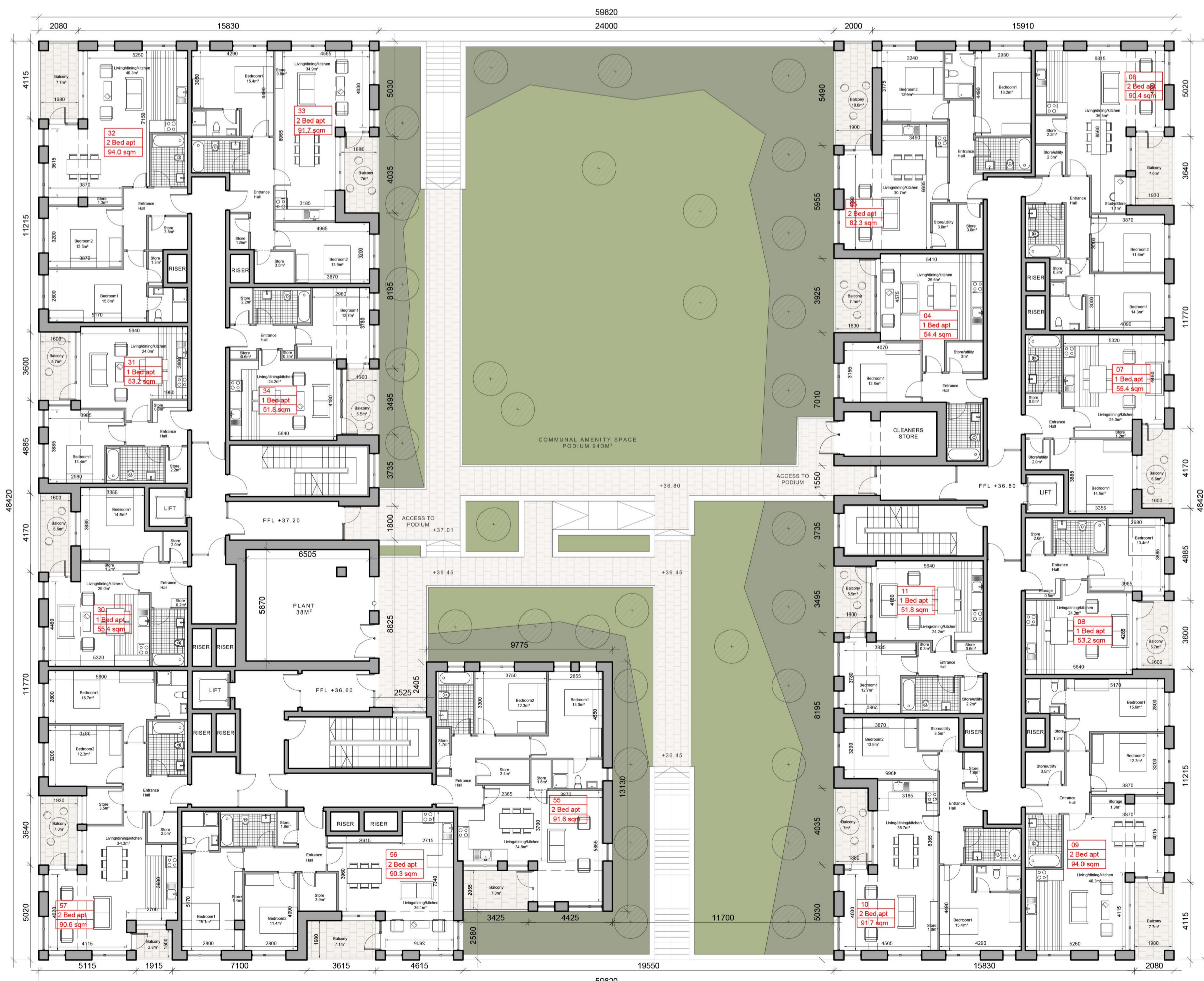
FIRST FLOOR PLAN WITH PODIUM

SEE THE BIG SPACE LANDSCAPE ARCHITECTS DRAWINGS FOR DETAIL OF LANDSCAPE TREATMENT